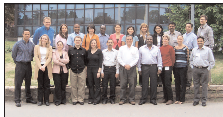
PLP in Strategic Alliances for Financial Services and Market Linkages participants, Turin, Italy, May 2005