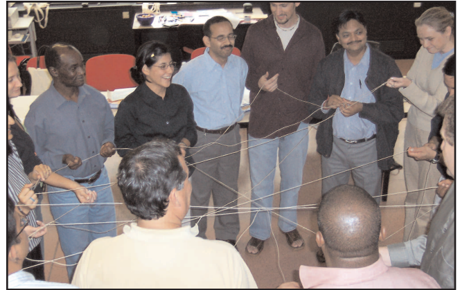
Participants are “linked.”